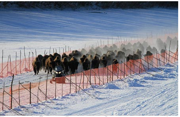
FIGURE 3: BISON RELEASE, SHAGELUK, Alaska Dept. of FISH and Game

Shageluk is considered rural and remote from Alaska's major urban areas. It is about 350 air miles northwest of Anchorage and 400 air miles southwest of Fairbanks, and it is accessible primarily by airplane throughout the year. When traveling to Shageluk from Anchorage, or from Shageluk to Anchorage, there are flights directly from Anchorage on Lake and Peninsula Airlines. Charters can be set up with various other airline companies out of Anchorage. People travel to nearby communities in the winter via snowmachine, and in the summer via boat. Nearby communities include: Grayling, Anvik, and Holy Cross (this region is often called GASH) all of which are along the Yukon River. Bulk items such as equipment or building materials, fuel, boats or household items are barged to Shageluk via Ruby Marine out of Nenana.