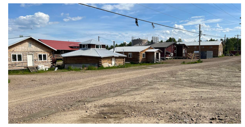
FIGURE 5: MAIN STREET IN SHAGELUK, 2024

Kashim (Tral Tth'et): Originally built in 1982, the Kashim is primarily used as a gathering place for a variety of events including traditional mask dances, weddings, community meetings, bingo, potlatches (funerals), church events, fundraisers, community events and