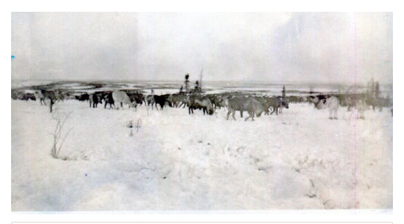
FIGURE 2: REINDEER HERD, SHAGELUK

Early contact with western outsiders was documented to have been in 1839, when Petr Komakov, crossed over from the Takotna River into the Innoko River drainage where he collected beaver pelts. The Russian American Company reported 6 major settlements on the Innoko River in 1861. Other contact with western culture to the area included interactions of the catholic and episcopal churches. In addition, other economic opportunities that