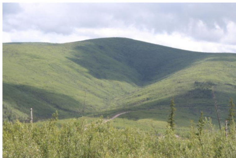
Figure 4 The road leading to the Native Village of Tetlin

Tetlin's lands incorporate the Upper Tanana River drainage ecosystem, which consists of complex mixture of geomorphologic and environmental features. In general, the southern boundary of the Upper Tanana Athabascan was defined by the Wrangell Mountains. This mountain range contains a number of glaciers that serve as the source of the White, Chisana, and Nabesna Rivers, along with their many tributaries. The Wrangell Mountains geographically separates the Tanana River valley from the southern coastal drainages. To the north of the Wrangell Mountains is the Nutzotin Mountain Range which runs parallel to the Wrangell Mountains. The Nutzotin Mountains are not as high in elevations