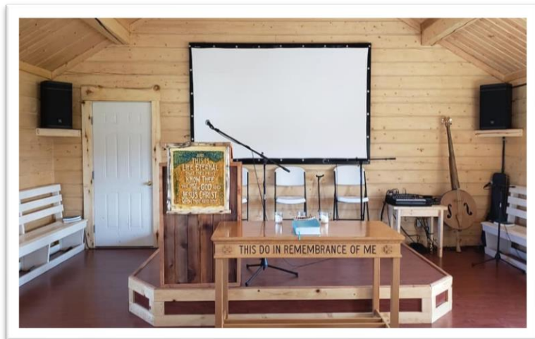
Figure 13 Tetlin Church

The Tetlin People are happy that the church was completed and many go weekly. There are other religious organizations and groups that travel to Tetlin throughout the year, mostly in the summer months, to host Bible Camps, Women's Retreats, and other such functions for the community.