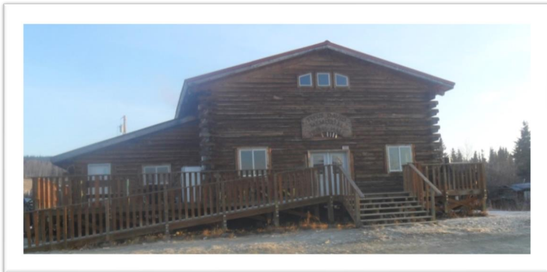
Figure 10 Titus David Tribal Hall

The Titus David Tribal Hall was constructed in 2003. The Tribal Hall is used for many