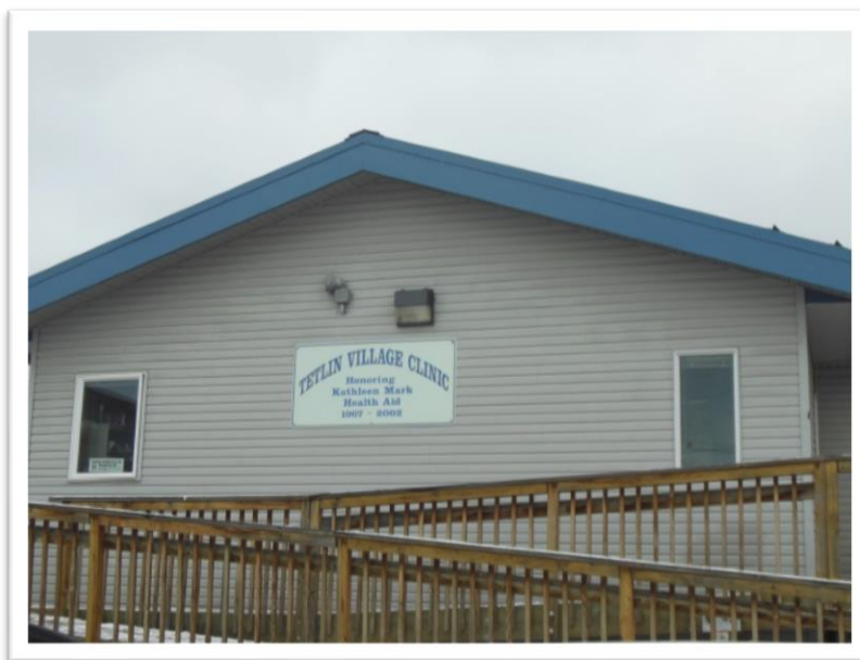
Figure 7 Tetlin Village Clinic

The Tetlin Health Clinic staff and clinical equipment is operated by Tanana Chiefs Conference and Tetlin Village Council pays for the operating costs such as fuel, electric, maintenance, janitorial, water and sewer. The current clinic facility was constructed in 2002 through funding provided through the Alaska Native Tribal Health Consortium (ANTHC) and matching funds from the Denali Commission. The clinic