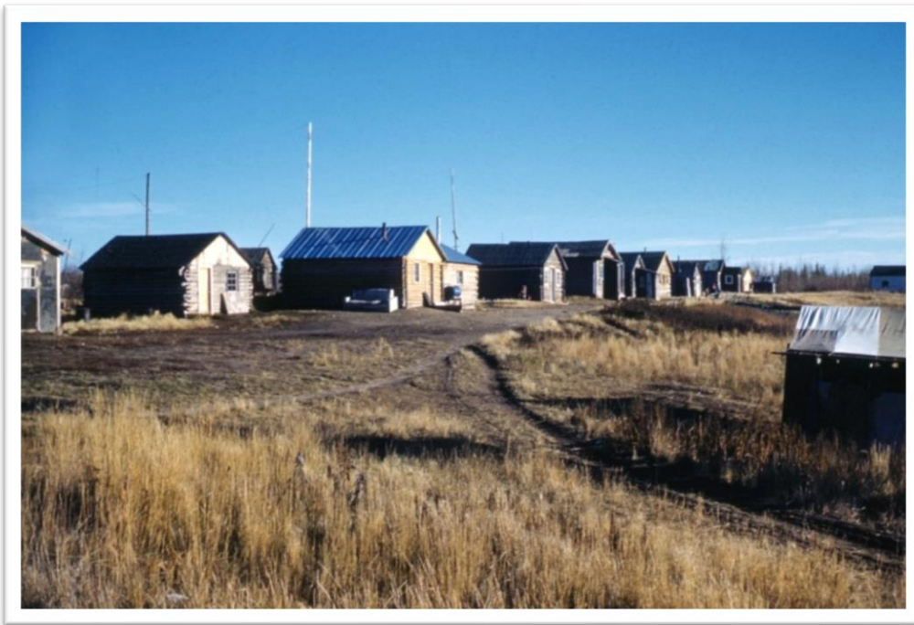
Figure 12 Tetlin Main Street. 1959.

Eighty five percent of the households in the community lack indoor plumbing. [1] Tetlin has twenty-eight houses on a haul system with ten houses having a working sewer system. A number of homes have had water and sewer installed but due to lack of maintenance they are in disrepair. In 2014, 5 homes had their water and sewer redone with assistance from ANTHC. Tetlin is working with ANTHC to secure additional funding to re-do more homes. Since the addition of the haul system, many homes did not maintenance their systems and today only a handful are site operable.