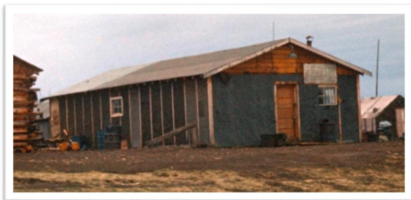
Figure 11 Tetlin Community Hall in 1959

The old Tribal hall referred to as the Community Center and/or Teen Center is used for the Environmental Program, Teen Center, Tribal Court Offices, Domestic Violence Advocacy, and Tribal Administration offices.