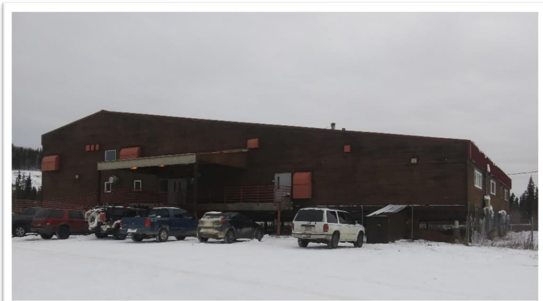
Figure 8 Tetlin School

The school was built in the early 1980's. It does not have a childcare facility. In 2012, Tetlin Council got a grant to build a bio-mass heating unit to heat the school to save on fuel costs, but currently, the bio-mass heating is not operating due to a number of factors involved.