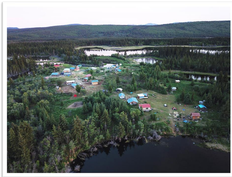
Figure 14 Last Tetlin Village, the traditional village site of the Tetlin People.

The week provides a great opportunity for adults and elders in the community to mentor the youth in our traditional way of living. Cultural activities include beading, talking circles, harvesting our food and building things like smoke houses the way it was done a long time ago.