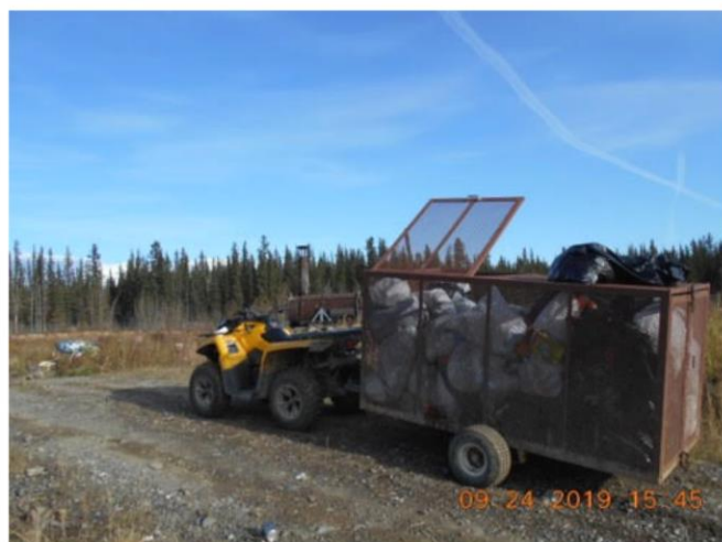
Figure 6 Tetlin Environmental Program Waste Collection System

Tetlin’s Solid Waste Management Plan was completed in 2010. The plan was completed through funding from the Environmental Protection Agency (EPA). The