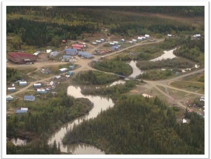
Figure 2 Today: Native Village of Tetlin

Today, majority of Tetlin Tribal Members do not hold any regional or village corporation shares, as Tetlin Native Corporation did not open enrollment to new shareholders for many decades.