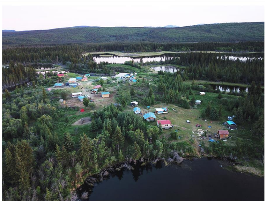
Figure 1 Last Tetlin