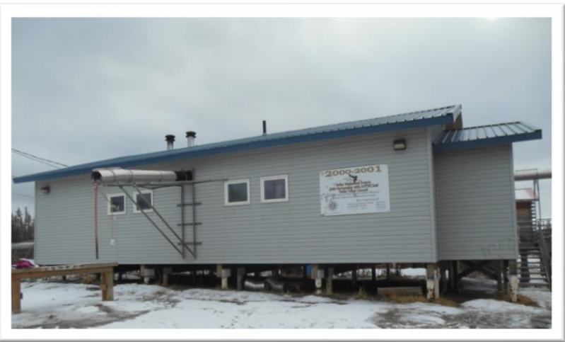
Figure 9 Tetlin Washeteria

The Washeteria was constructed between 2000 and 2001 through a joint project between the Alaska Native Tribal Health Consortium (ANTHC) and the Tetlin Village Council. The project was funded by several agencies. The Council operates the Washeteria and provides water to the community. The Washeteria consists of