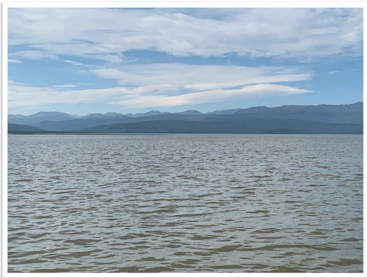
Figure 5 Manh Choh (Big Lake).Also known as Tetlin Lake on USGS Maps.

Tetlin lies within the continental climatic zone, with cold winters and warm summers. In the winter, cold air settles in the valley and ice fog and smoke are common. The average low during January is -32 °F; the average high during July is 72 °F. Extreme temperatures have been measured from -71 to 99 °F.