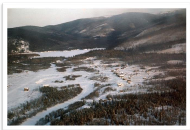
Figure 3 Circa 1960s: Native Village of Tetlin

traditional and spiritual importance for local residents, which are critical to the cultural, physical and mental health of Tetlin Tribal members. The strength and importance of kinship, social bonds, and ties to the land and wildlife lead many people to prefer residence in the area despite the fact that employment opportunities are normally quite limited. 2