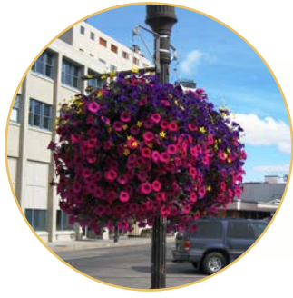
Pink and blue wave petunias and yellow bidens