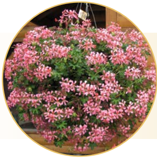
Ivy Leafed Geranium