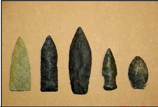
Weapon Tips from a Private Collection, Healy Lake.

accessible in summer only by riverboat or floatplane.