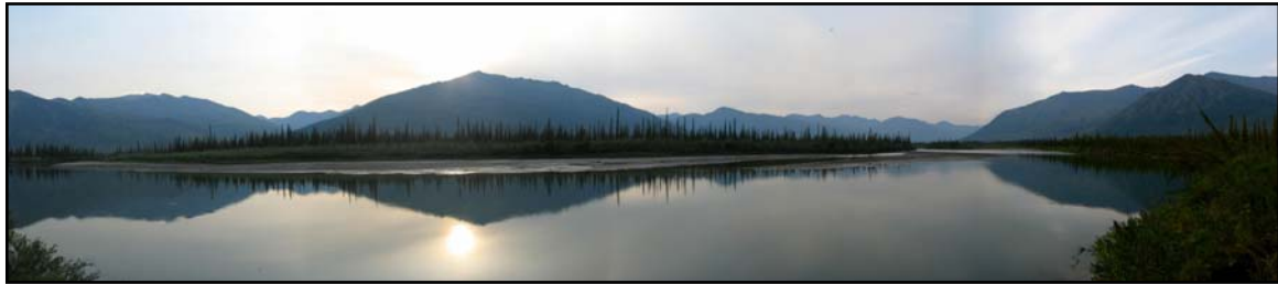
The west shore of Chandalar Lake, photographed from the Yasuda Site.

The second is the Lundin Dune Site, where preliminary testing has found several prehistoric localities. The full potential of this site is unknown, however the stratigraphic context appears to be excellent and the topography provides expansive overlooks of the Yukon River valley.