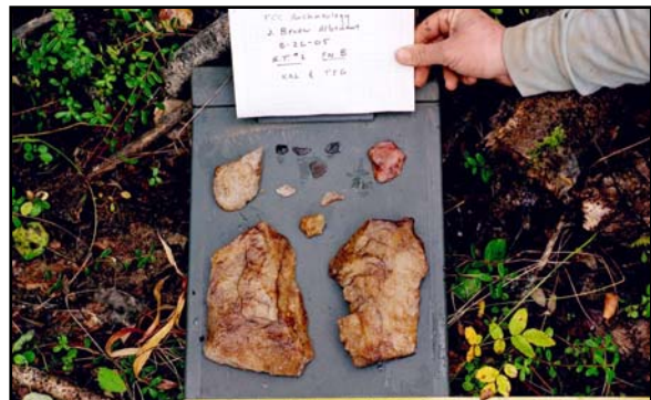
"Quartzite Horizon" bifaces, unifaces and flakes found during testing at the Linda's Point Site, Healy Lake.

We have several other small monitoring and survey projects scheduled which will be of interest to anyone seeking field experience in remote areas of Interior Alaska. With the exception of Linda's Point, all of our 2010 projects will take place in wilderness settings