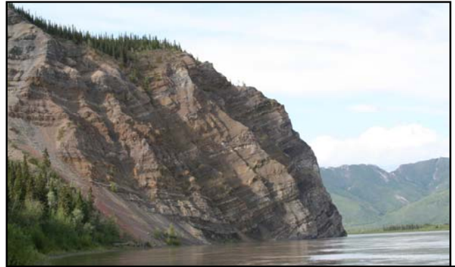
Calico Bluff, one kilometer downstream from the David Site.

TCC an Athabascan non-profit organization based in Fairbanks with land management responsibilities throughout the Yukon River drainage. 2010 marks our 14 th field season. This August we will be mapping, testing or excavating at four archaeological sites.